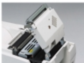
Paper Jam & Skew Free technology