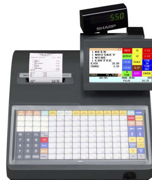
(actual display area: 142 x 80mm)